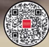
Iowa State University